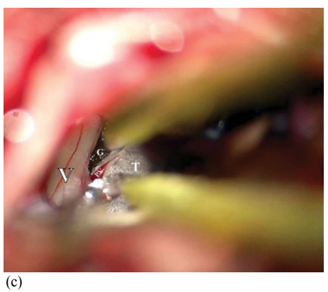
Figure 1: This is a left typical trigeminal case.

(a) Intraoperatively, as the cerebellum was raised, a branch of petrosal vein (pv) was observed to penetrate into the trigeminal nerve. With further dissection, a loop of the superior cerebellar artery (SCA) compressing the trigeminal nerve rostrally was found. As the arachnoids were opened, the SCA was moved away from the nerve and a small piece of moist gelfoam was inserted between them.